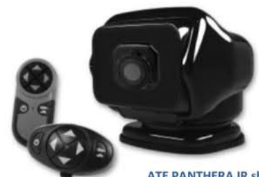
ATE PANTHERA IR shown with wireless remote controls

Export: All thermal imaging systems are subject to export control. Standard NTSC (30Hz) and PAL (25Hz) units are subject to export restrictions and licensing by the U.S. Dept. of Commerce. Models with video frame rates at or below 9Hz do not require licensing but do require compliance with other export requirements. Please contact Aspect Technology & Eqpt Inc for details concerning export compliance.