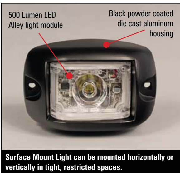
Surface Mount Light can be mounted horizontally or vertically in tight, restricted spaces.

Provides LED Alley lighting for undercover vehicles when mounted to the push bumper or prisoner partition.