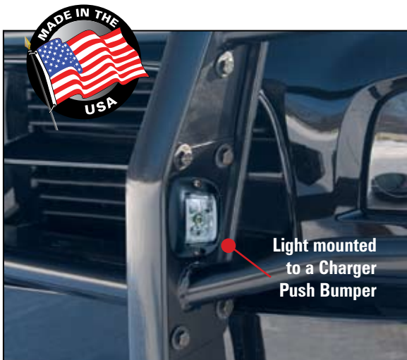
Light mounted to a Charger Push Bumper

Provides LED Alley lighting for undercover vehicles when mounted to the push bumper or prisoner partition.